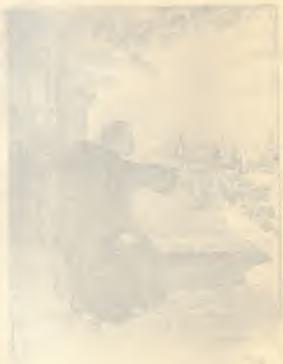
The Star of Bethlehem